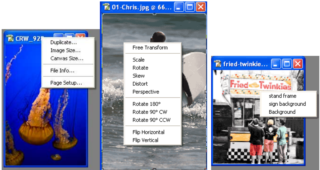
Image Title Bar

Using context menus saves you a lot of time. They are accessed on a PC by Right Clicking or Control Clicking on a Mac. There are Context Menus everywhere! Right Click/Control Click on the title bar of an image for instance. Try to remember to bring up Context Menus with every tool. Once any tool is active, you can access most of its features by Right Clicking/Control Clicking. One Context Menu that I use a lot is with Transform as shown below. Also, with the Move tool active, you'll see what layers are in that area. You can then activate any layer by clicking on the desired one. No need to go over to the layers palette! Right Click/Control Click when you have a brush active and it brings up your brushes palette. It's really a timesaver and a good reason for Mac people to consider buying a two button mouse!